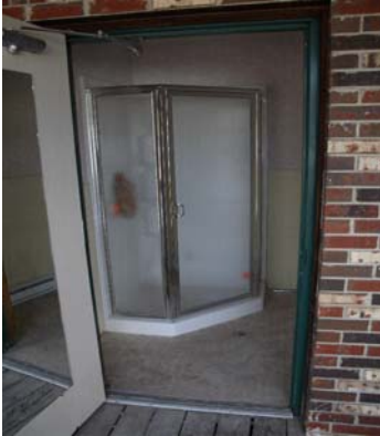
Our new shower enclosures.