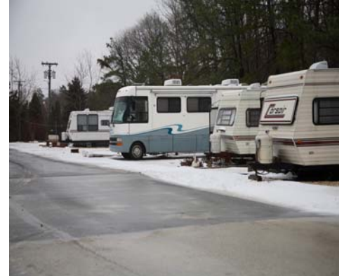
March snow getting in the way of things.